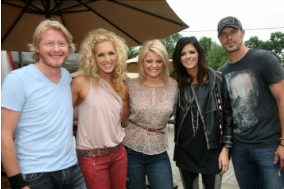
L-R: Phillip Sweet, Kimberly Schlapman, Lauren Alaina, Karen Fairchild, Jimi Westbrook