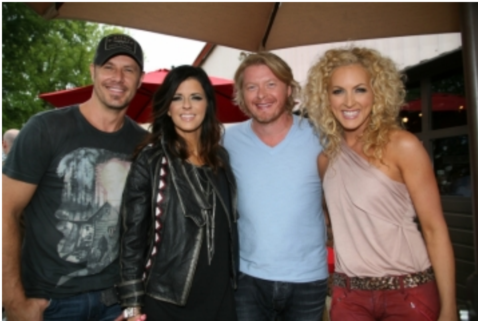
L-R:Jimi Westbrook, Karen Fairchild, Phillip Sweet, Kimberly Schlapman

Little Big Town's 6th annual Ride For A Cure event took place this past Sunday, June 10th in Franklin and Columbia, TN. The annual motorcycle ride portion of the event was cancelled due to inclement weather but the pre-ride Jam Session at Mickey Roo's and All-Star Jam Session at the Harley-Davidson Columbia Superstore continued as planned.