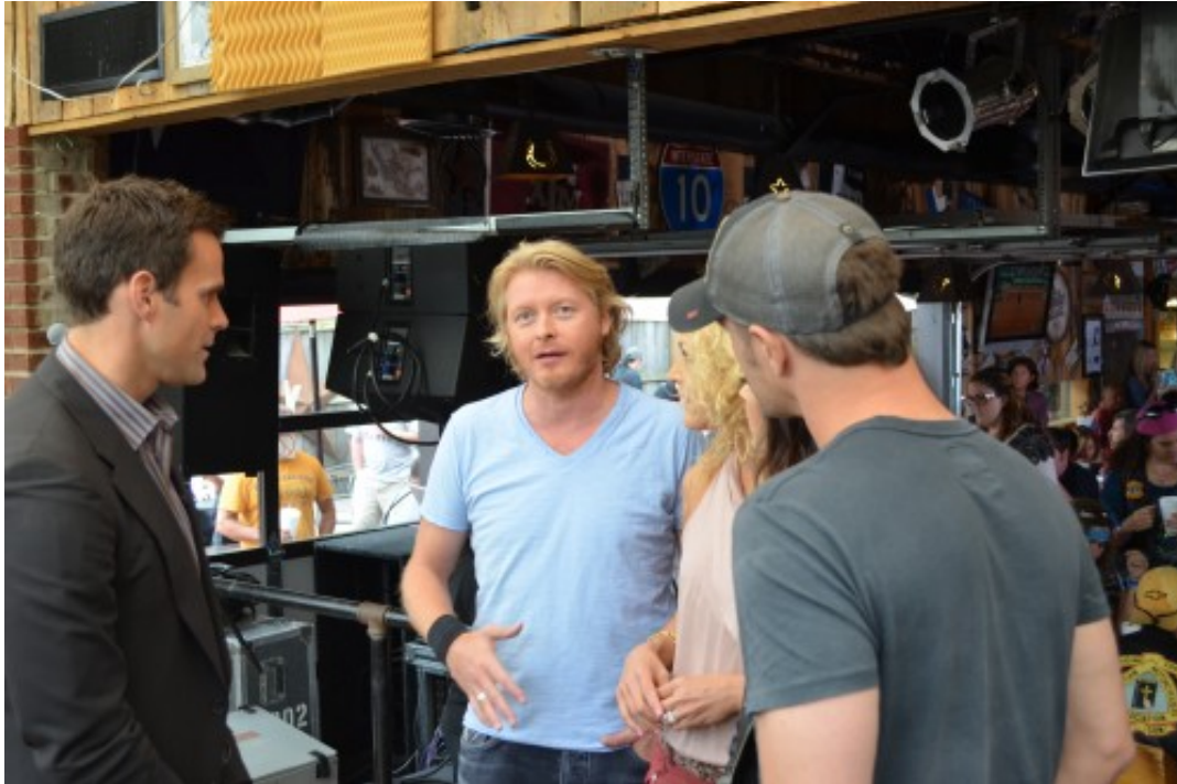
Little Big Town interviewing with Good Morning America

One of the most coveted auction items of the day was an autographed Epiphone Guitar signed by Little Big Town , Rascal Flatts and Edens Edge and was purchased by Mike Wolfe from The History Channel's successful reality show, American Pickers .