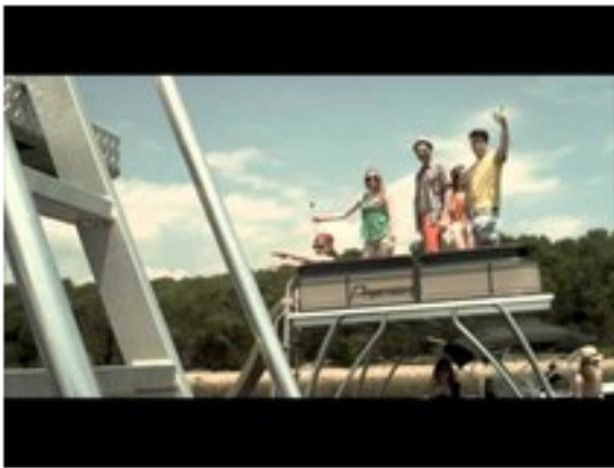
Video: Little Big Town - "Pontoon"

Little Big Town's current single is " Pontoon ," which is making its way up the charts. The group recently performed the single on the 2012 CMT Music Awards , and it was one of the most memorable moments from the awards show, as they performed atop a pontoon decked out exactly like the one in their official video for the song. BTW, you can watch the group's video for "Pontoon" by clicking on the link to the left.