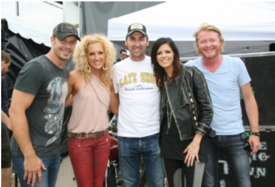
L-R: Jimi Westbrook, Kimberly Schlapman, Mike Wolfe, Karen Fairchild, Phillip Sweet