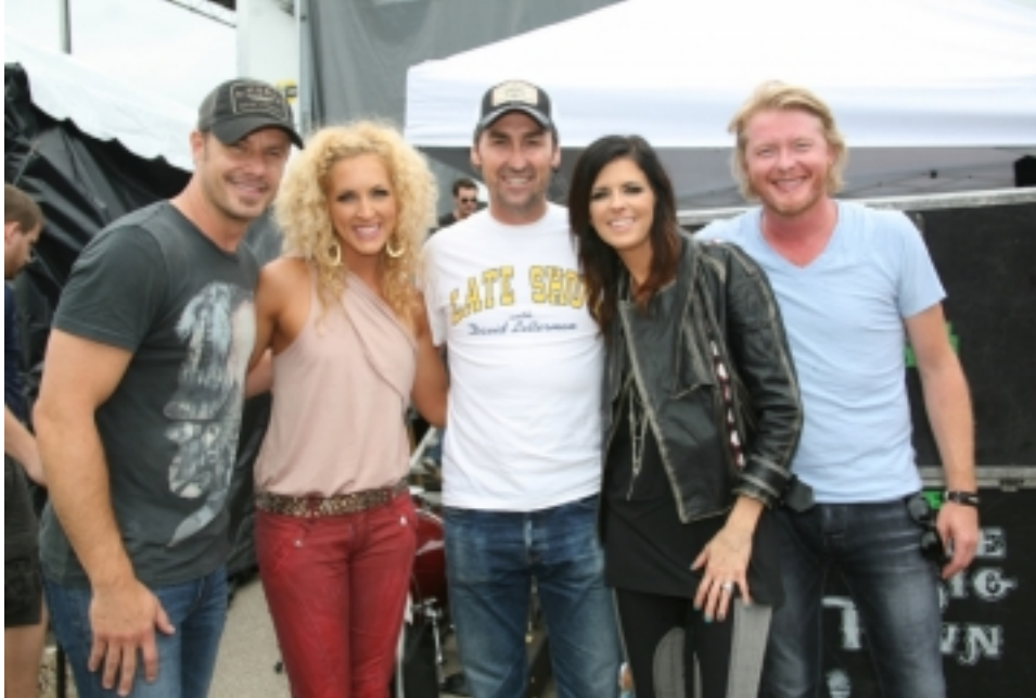
L-R: Jimi Westbrook, Kimberly Schlapman, Mike Wolfe, Karen Fairchild, Phillip Sweet

One of the most coveted auction items of the day was an autographed Epiphone Guitar signed by Little Big Town, Rascal Flatts and Edens Edge and was purchased by Mike Wolfe from The History Channel's successful reality show, American Pickers .