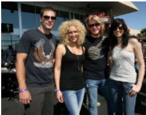
Little Big Town

Congratulations to Little Big Town whose Sixth Annual Ride for a Cure raised over $55,000 for the TJ Martell Foundation, despite the fact that the actual motorcycle ride portion of the event had to be cancelled due to inclement weather. The pre-ride and post-