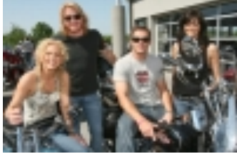
Little Big Town

Capitol Nashville's LITTLE BIG TOWN'S 6th annual "Ride For A Cure" event took place this past SUNDAY (6/10), in FRANKLIN and COLUMBIA, TN, raising over $55,000 for the T.J. MARTELL FOUNDATION, which specializes in finding cures for Leukemia, Cancer and AIDS. The annual motorcycle ride portion of the event was canceled due to inclement weather but the pre-ride Jam Session and All-Star Jam Session continued as planned.