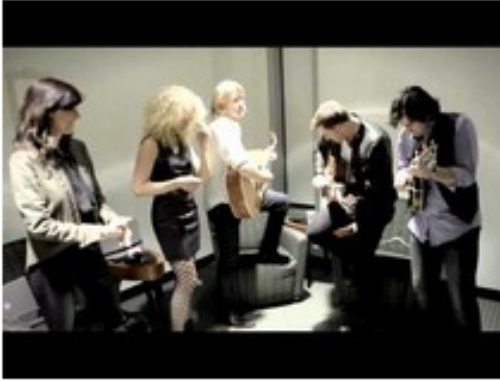
Video: Little Big Town's cover of Bruno Mars' "Grenade"