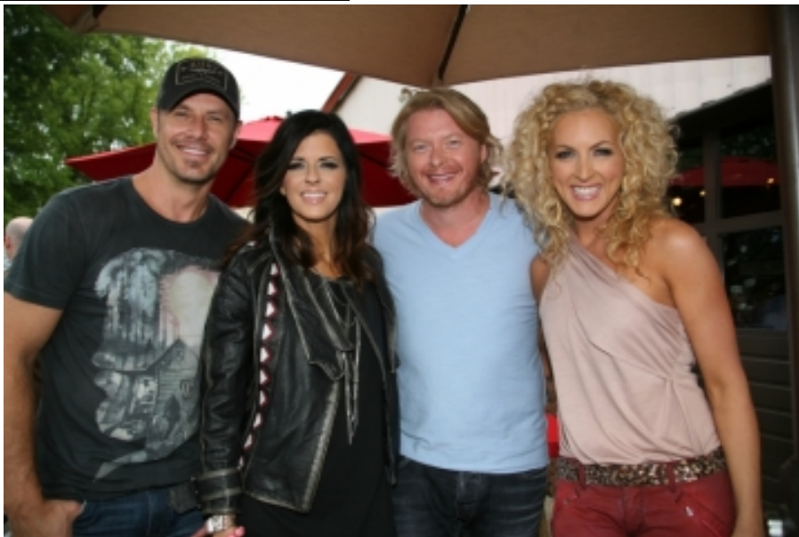
L-R: Jimi Westbrook, Karen Fairchild, Phillip Sweet, Kimberly Schlapman

Little Big Town's 6th annual Ride For A Cure event took place this past Sunday, June 10th in Franklin and Columbia, TN. The annual motorcycle ride portion of the event was cancelled due to inclement weather but the pre-ride Jam Session at Mickey Roo's and All-Star Jam Session at the Harley-Davidson Columbia Superstore continued as planned.