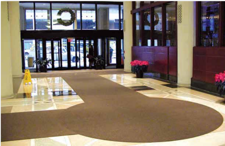
30 South Meridian Indianapolis, IN

Your building needs more than squares and oblongs. Transitions will help ensure that matting is in the direct walk pattern of your guests...and do it with style.