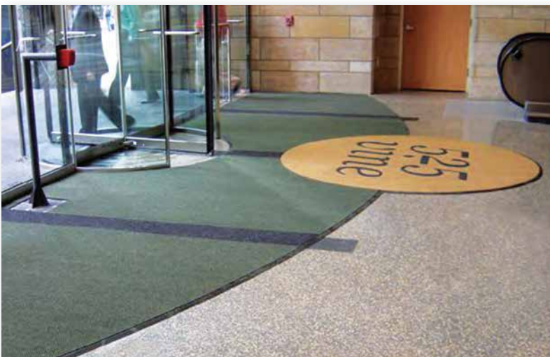
525 Vine Street Cincinnati, OH