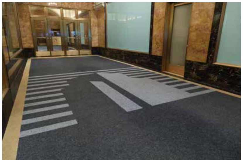
Olmstead Building, New York, NY