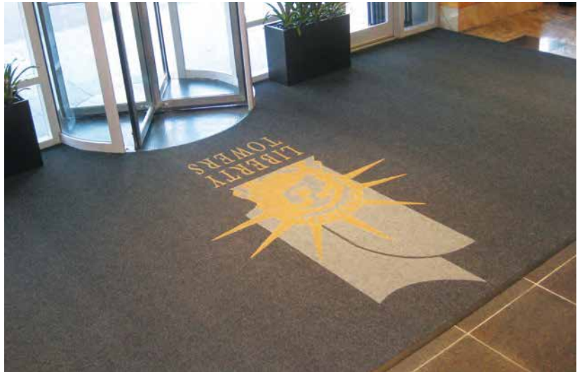
Liberty Towers, Jersey City, NJ

Our goal is to deliver consuming customers and our distributor partners high quality products, design, and layout. The Proform result is improved safety, better protection of interior surfaces, and dramatically more attractive lobbies.