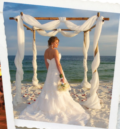
Sugar Beach Weddings