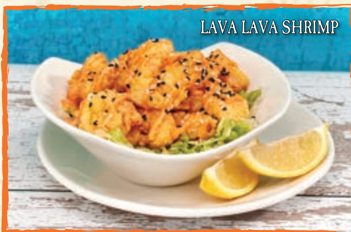
LAVA LAVA SHRIMP

chili and lime spiked aioli (1200 cal.) 17.95