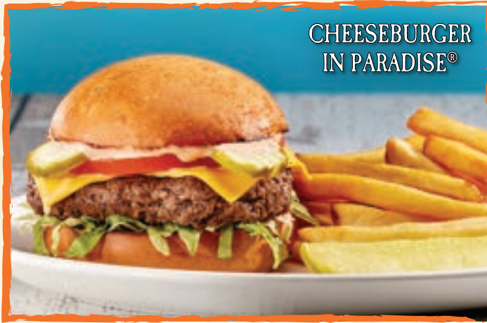
CHEESEBURGER IN PARADISE®