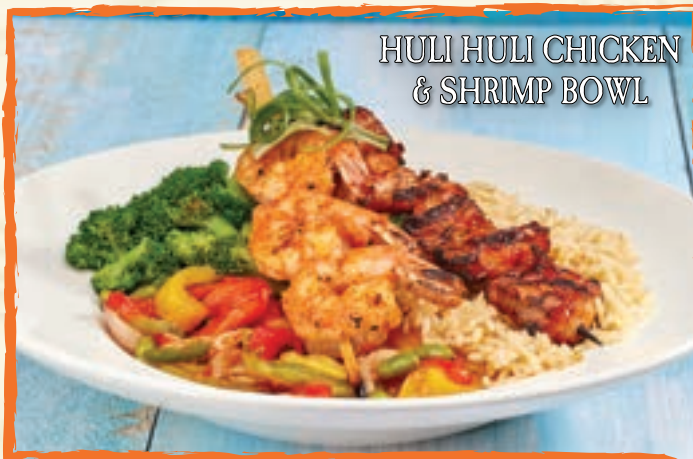
HULI HULI CHICKEN & SHRIMP BOWL

coconut crusted and fried, horseradish-orange marmalade dipping sauce, French fries, cilantro lime coleslaw (1550 cal.) 27.95