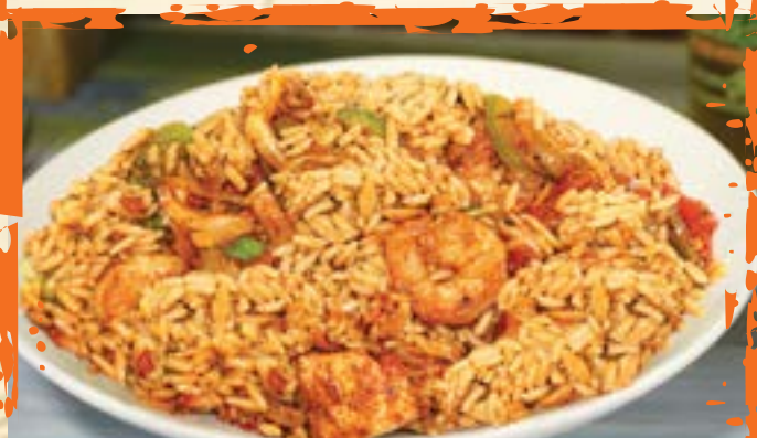
JIMMY'S JAMMIN' JAMBALAYA®

Cajun rice loaded with shrimp, chicken and Andouille sausage simmered in a spicy broth $19.50