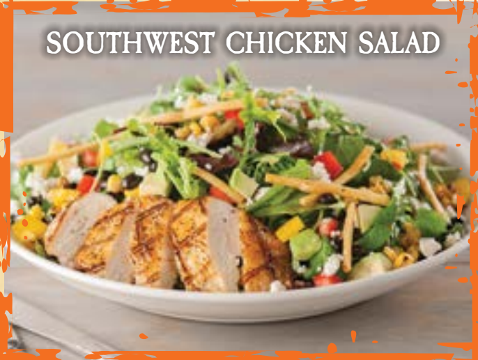
SOUTHWEST CHICKEN SALAD