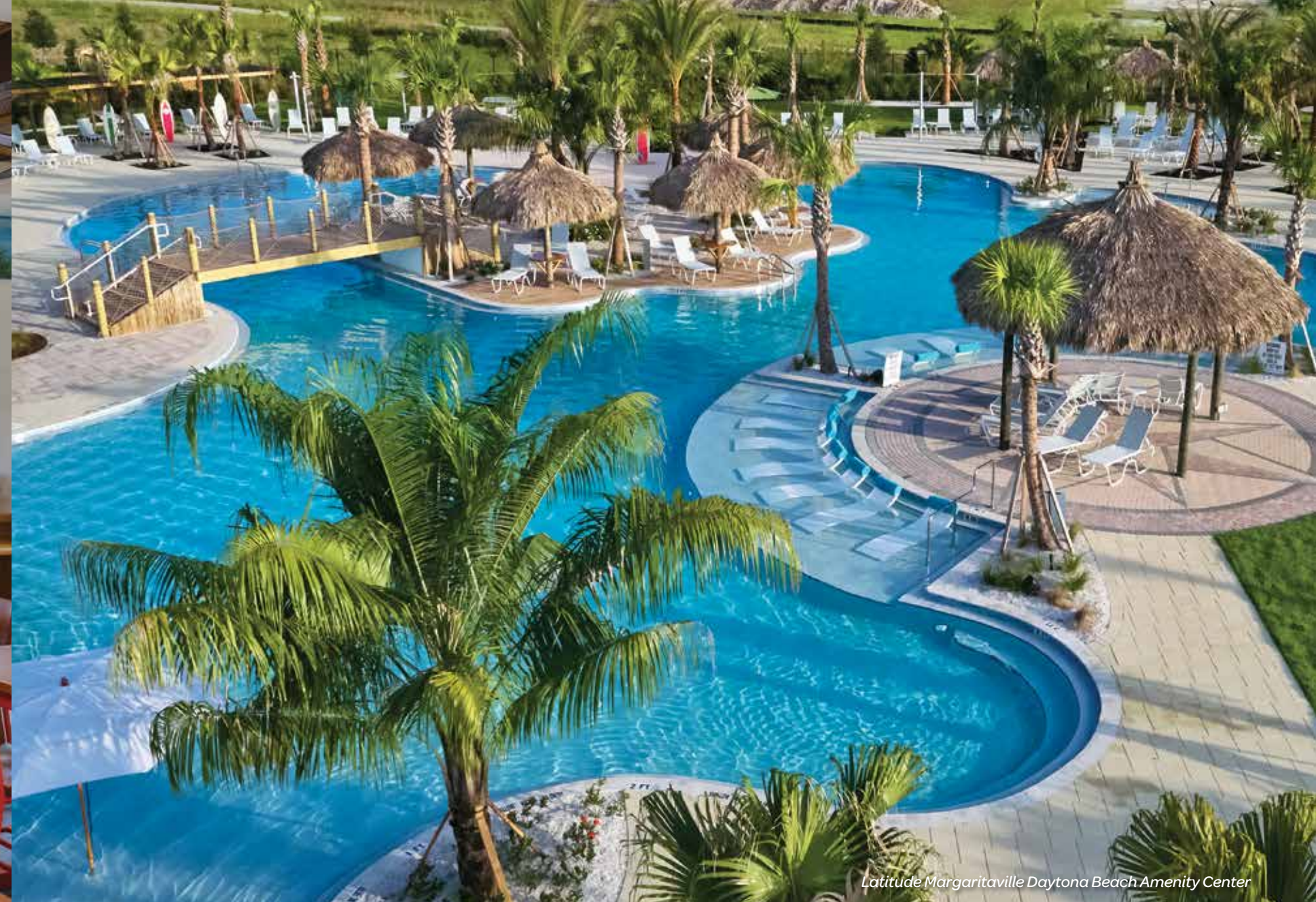
Latitude Margaritaville Daytona Beach Amenity Center