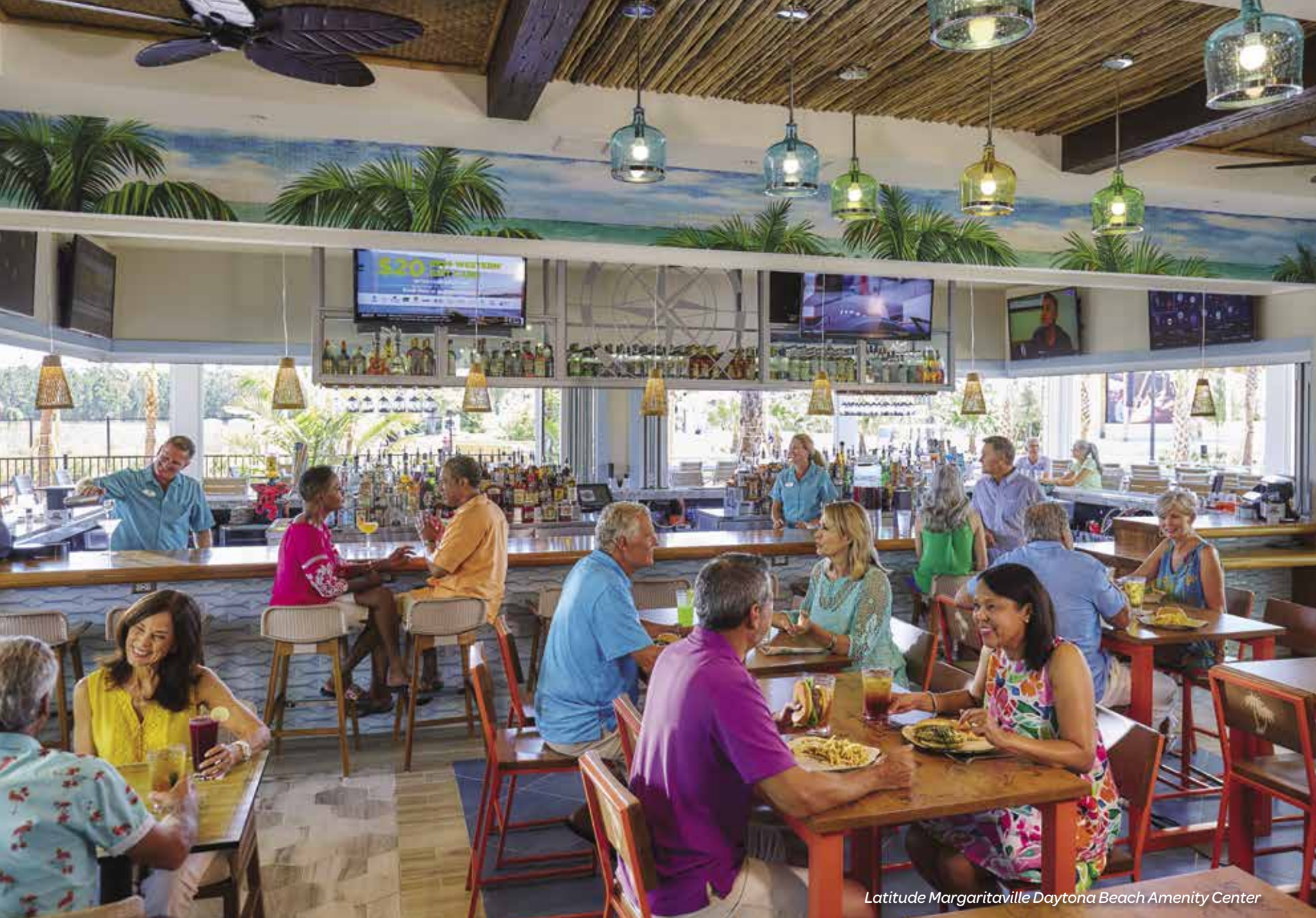
Latitude Margaritaville Daytona Beach Amenity Center