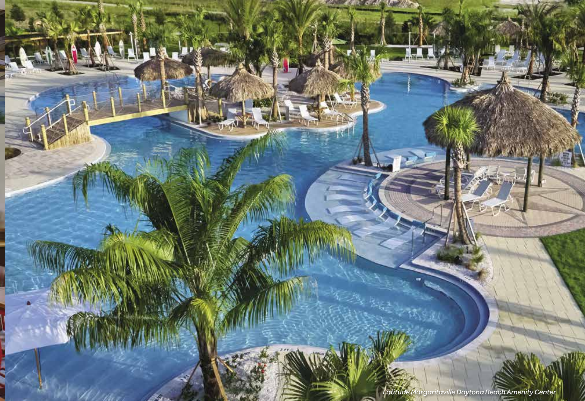
Latitude Margaritaville Daytona Beach Amenity Center