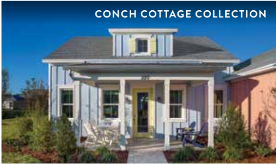
CONCH COTTAGE COLLECTION