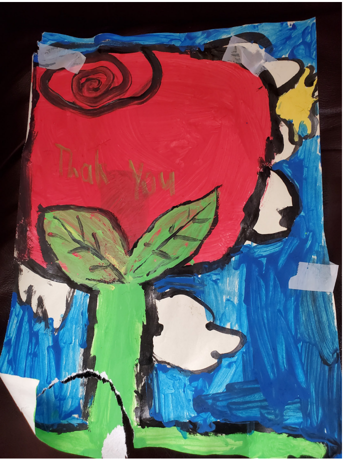
Flower painting by Isabella (gr. 3) shared via “Staying Home Staying Creative.”