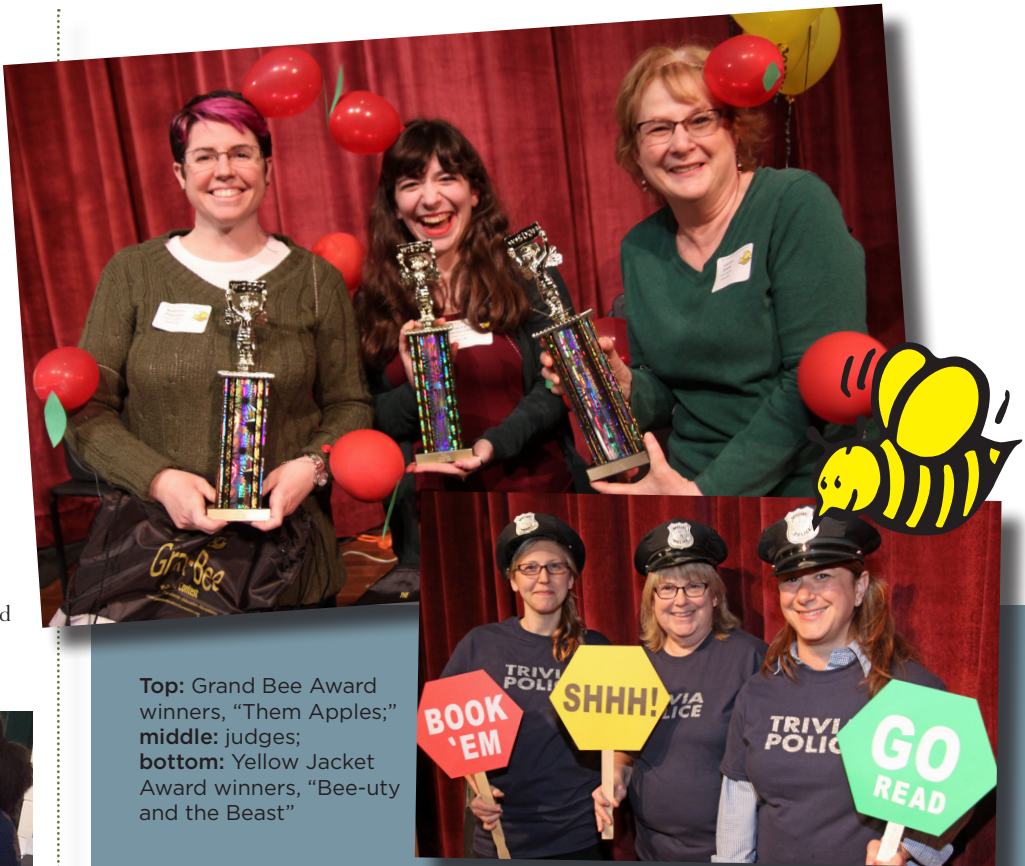
Top: Grand Bee Award winners, "Them Apples;" middle: judges; bottom: Yellow Jacket Award winners, "Bee-uty and the Beast"