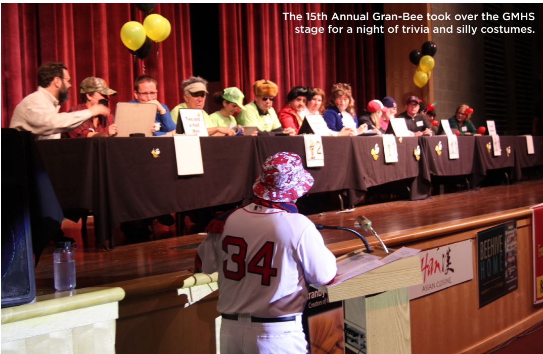
The 15th Annual Gran-Bee took over the GMHS stage for a night of trivia and silly costumes.