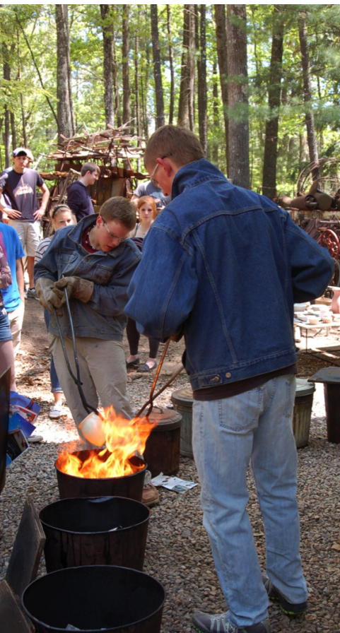
Left to right: GMHS Chemistry in Art/ Art in Chemistry, Valley Pre-School percussion concert, The Amazing Nano Brothers Juggling Show, and GMHS paleontology lab.

The Granby Education Foundation's Community Grant Program continues to make an impact on our community's educational environment. This year the GEF was able to introduce a third winter grant cycle. Between the fall of 2014 and the spring of 2015, the GEF received 13 grant requests and awarded 11 grants. In 2014–15, the recipients ranged from pre-school age to senior citizens; and from school-based programs to community non-profits. More information regarding these grants and the Community Grant Program can be found on the GEF's website: www.granbyeducationfoundation.org .