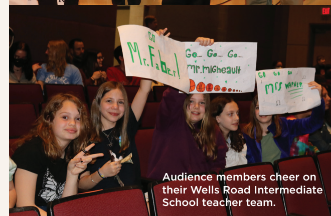
Audience members cheer on their Wells Road Intermediate School teacher team.

The Bee came back! After a two-year hiatus, our community overwhelmingly came out to support our Gran-Bee Trivia Competition through sponsorships, auction items, teams, crazy costumes, and lots of audience laughter. Thanks to everyone who participated, the Granby Education Foundation raised $11,400 to support our Community Grants program. The GEF is buoyed by the clear message we received in May that our fundraising creates fertile ground for innovative educational projects which positively impact our residents of all ages. By offering a hand to our schools and local nonprofits, the GEF enriches our community through the arts, world language, cultural exploration, and STEM. Granby has always valued quality education. The GEF is proud to support Granby's interest in lifelong learning.