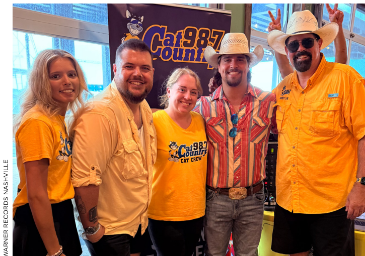
WARNER RECORDS NASHVILLE