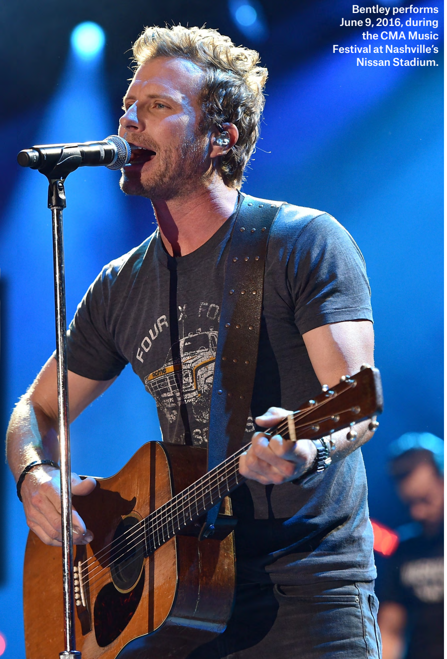
Bentley performs June 9, 2016, during the CMA Music Festival at Nashville's Nissan Stadium.