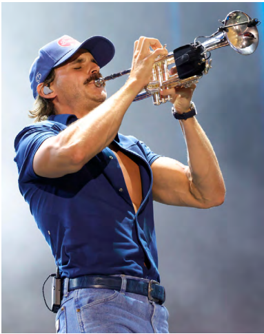
Tucker Wetmore surprised stadium ticket-holders June 4 by playing trumpet to launch into his current single, "Brunette."

The Country Music Association estimated 100,000 visitors per day participated in the CMA Fest in Downtown Nashville June 4-7. It marked the last year the event's nightly concerts were to be staged at Nissan Stadium – a new stadium is expected to open next spring. Here are a few images from the celebration: