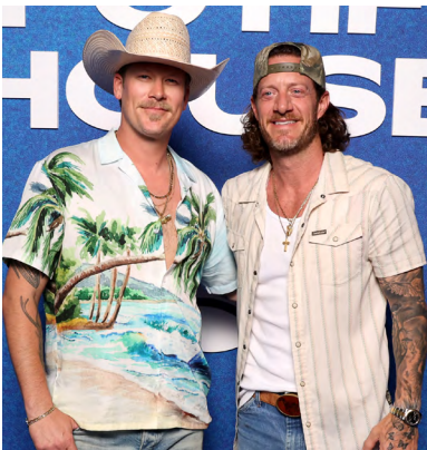
Florida Georgia Line members Brian Kelley (left) and Tyler Hubbard performed seven songs at Spotify House on June 5.