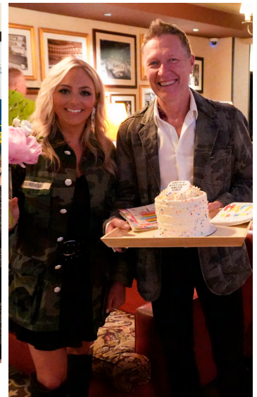
HunterGirl received a birthday cake from Craig Morgan five days early when they performed on the Grand Ole Opry May 19.