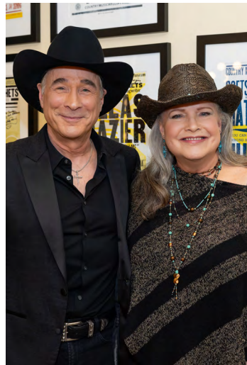
Clint Black discussed his new book, Killin’ Time: My Life and Music , with TV/radio personality Lorianne Crook May 23 in a Country Music Hall of Fame and Museum event in Nashville.