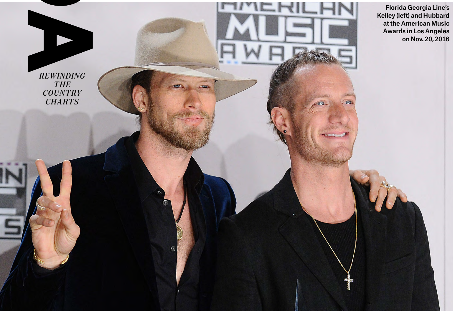
Florida Georgia Line's Kelley (left) and Hubbard at the American Music Awards in Los Angeles on Nov. 20, 2016