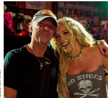
Kenny Chesney welcomed surprise guest Megan Moroney for an April 18 performance at Flora-Bama in Pensacola, Fla., celebrating the 10-year anniversary of Chesney's No Shoes Radio airing on SiriusXM.