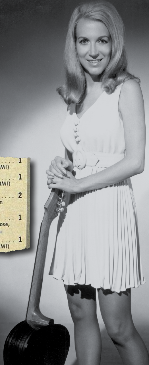
Seely, from an early photo shoot, circa 1970.