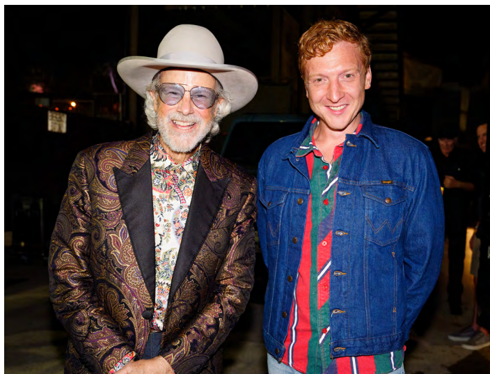
Robert Earl Keen (left) and Tyler Childers backstage on Aug. 28 at Keen's Applause for the Cause benefit in New Braunfels, Texas, which raised a reported $3 million for flood relief.