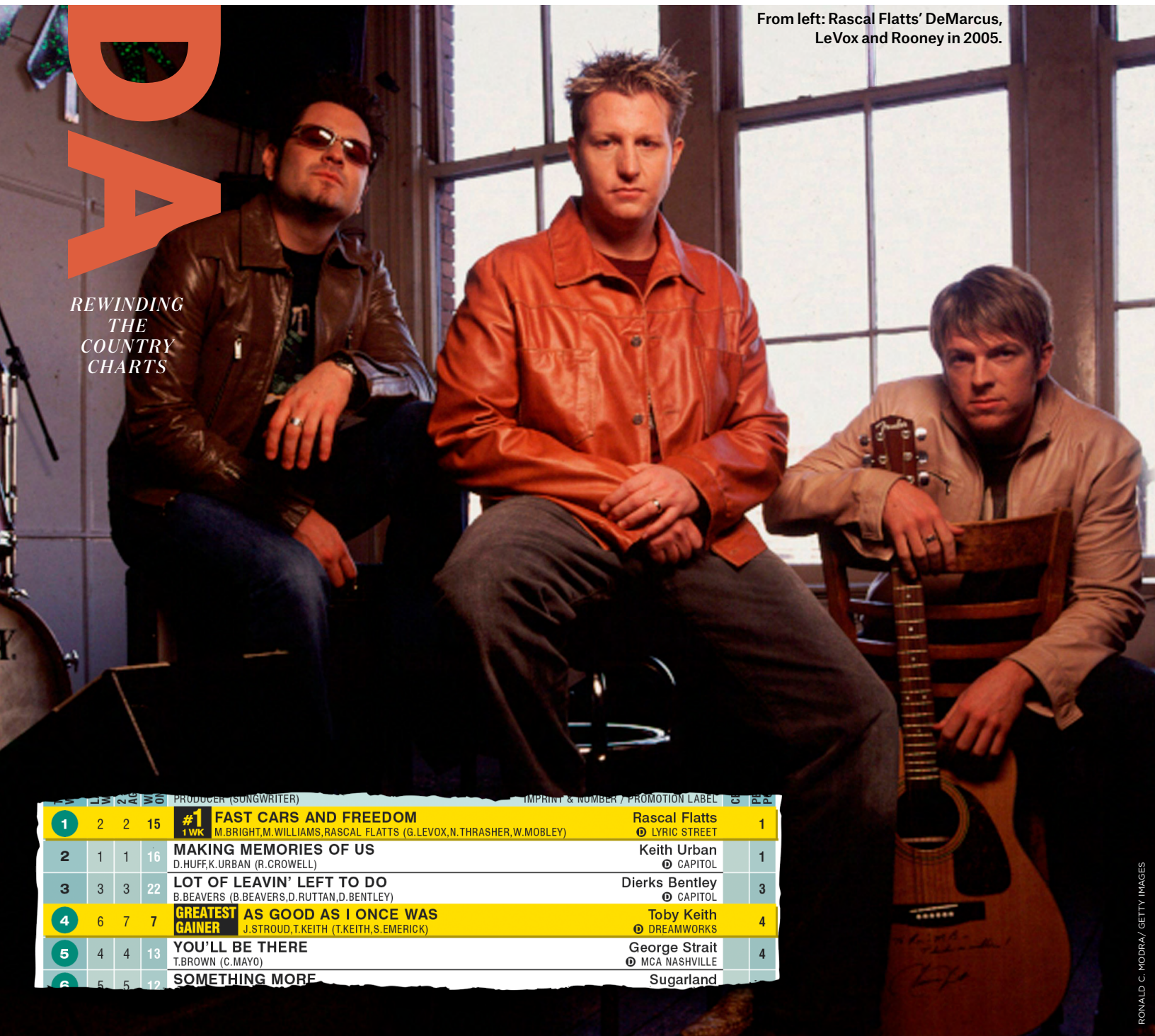
From left: Rascal Flatts' DeMarcus, LeVox and Rooney in 2005.