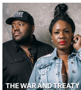
THE WAR AND TREATY