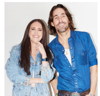
Jake Owen visited with Kelleigh Bannen during the Nov. 25 installment of Apple Music Country's Today's Country Radio With Kelleigh Bannen .