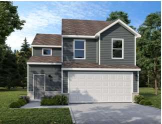
SHOWN WITH BRICK OPTION A