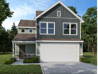
SHOWN WITH BRICK OPTION A