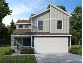
SHOWN WITH BRICK OPTION A