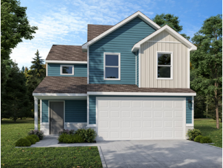
SHOWN WITH BRICK OPTION A