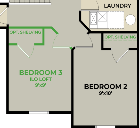
OPTIONAL BEDROOM 3 ILO LOFT

*Plan includes an unfinished powder/half bath on the first floor