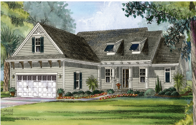
Optional Elevation E5