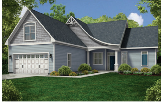
Optional Elevation B2