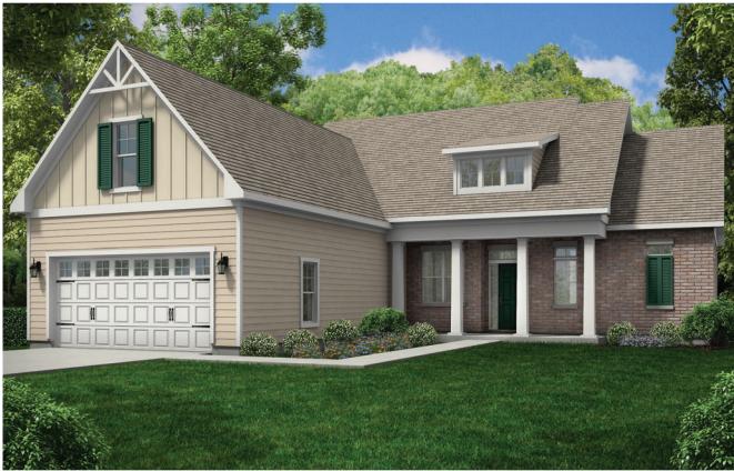
Optional Elevation C3