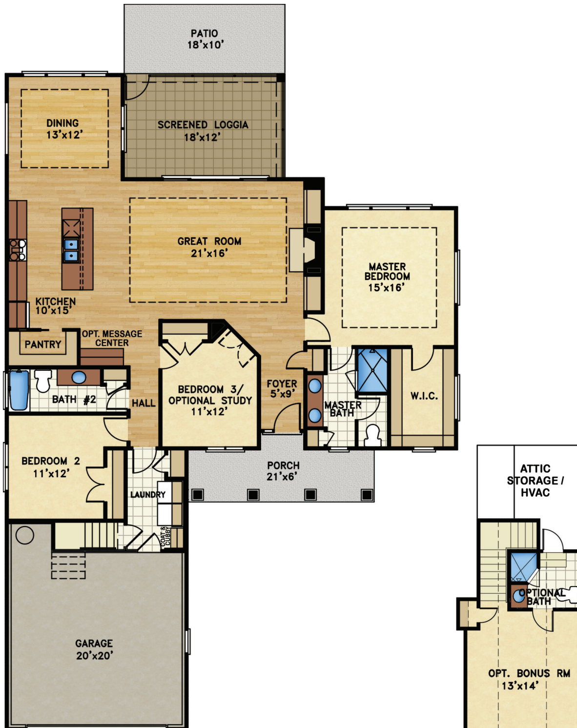
Optional Bonus & Bath 295 sq. ft.

All renderings are the artist's impression of the home. The drawings and square-footage notations are approximate and are only to be used for reference. They should not be relied upon as representations, expressed or otherwise, of the final detail of the residence.