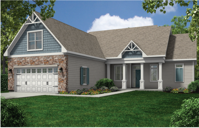
Included Elevation A1