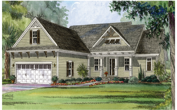
Optional Elevation D4