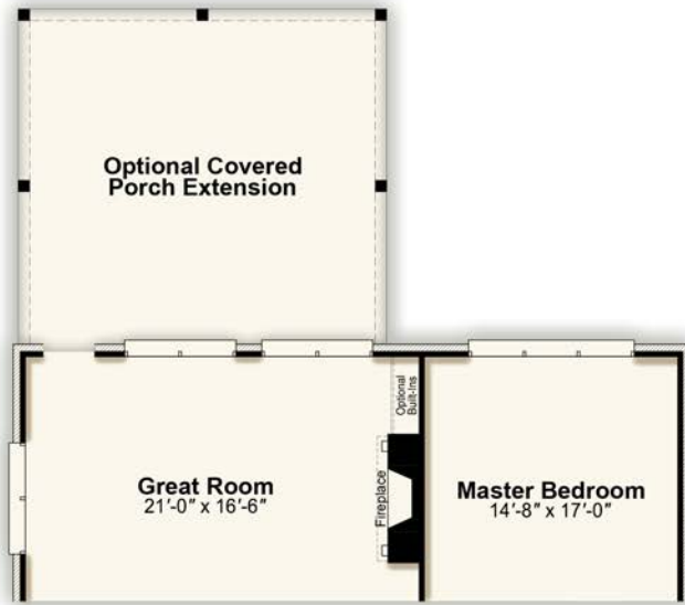
Opt Covered Porch Extension