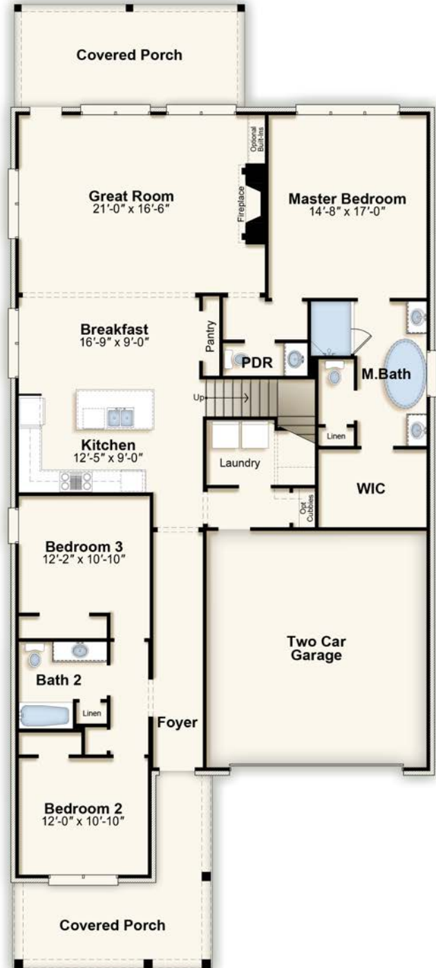
FIRST FLOOR - ELEV A