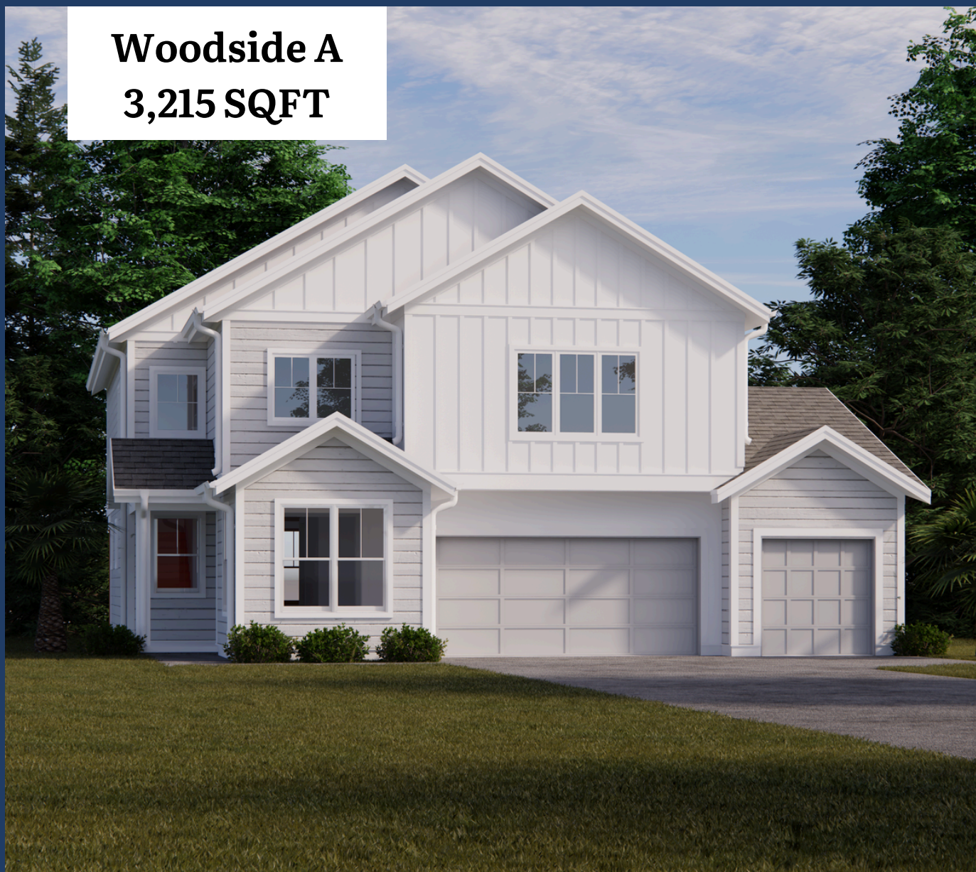
Woodside A 3,215 SQFT