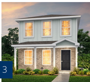
Elevation B 3