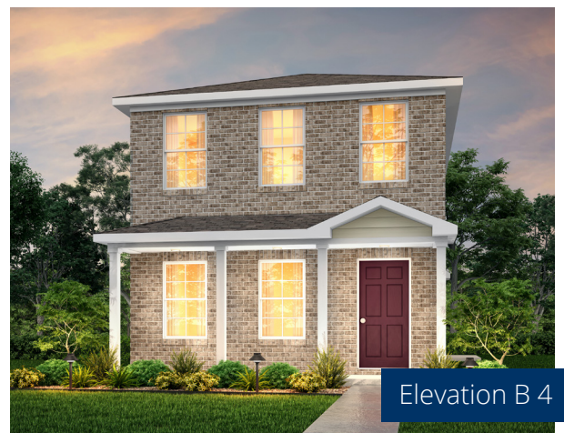
Elevation B 4