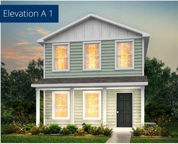
Elevation A 1