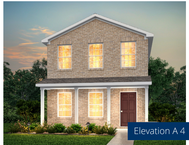
Elevation A 4