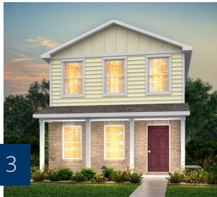
Elevation A 3