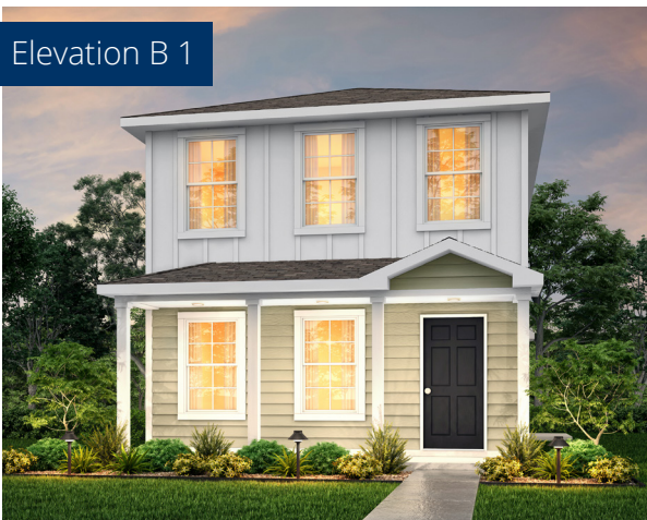
Elevation B 1