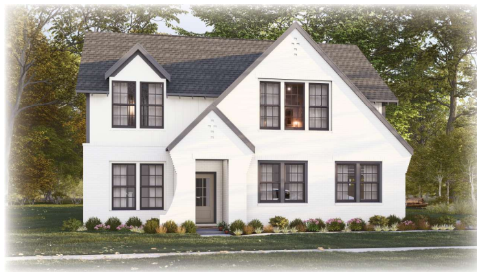
Elevation E-Side Load Garage