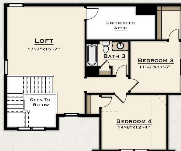
Second Floor A