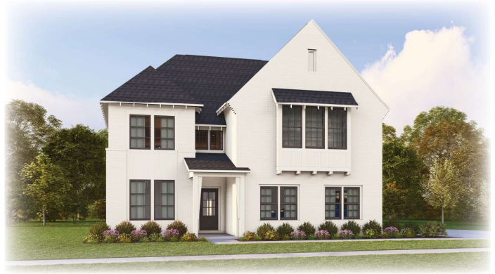
Elevation B-Side Load Garage