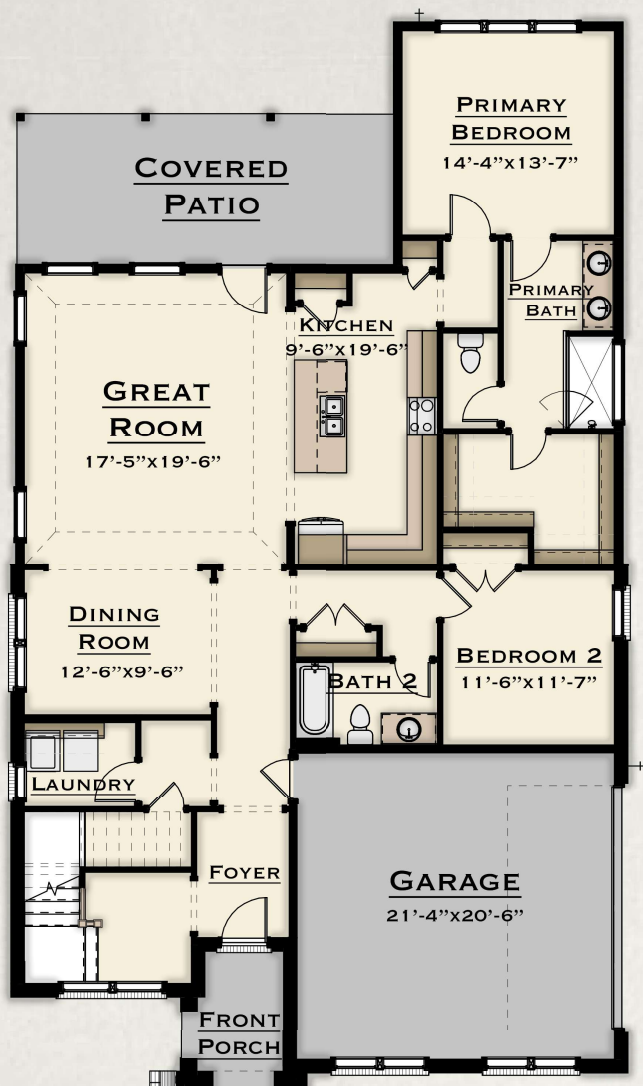
Main Level E