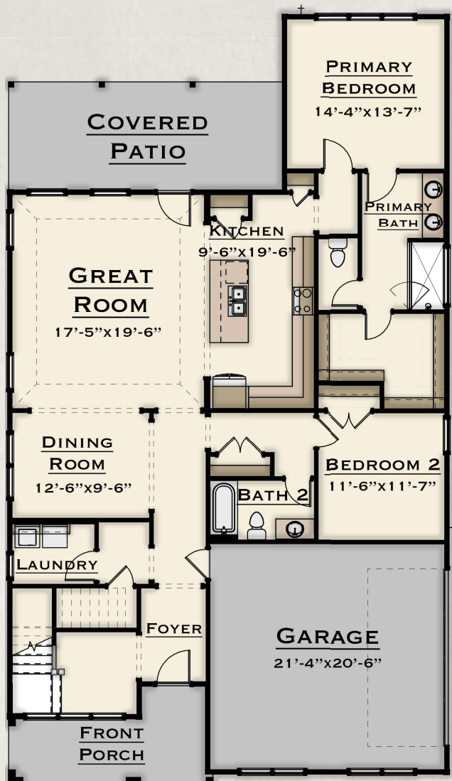
Main Level A