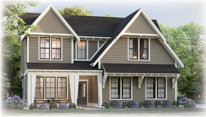
Elevation A-Side Load Garage