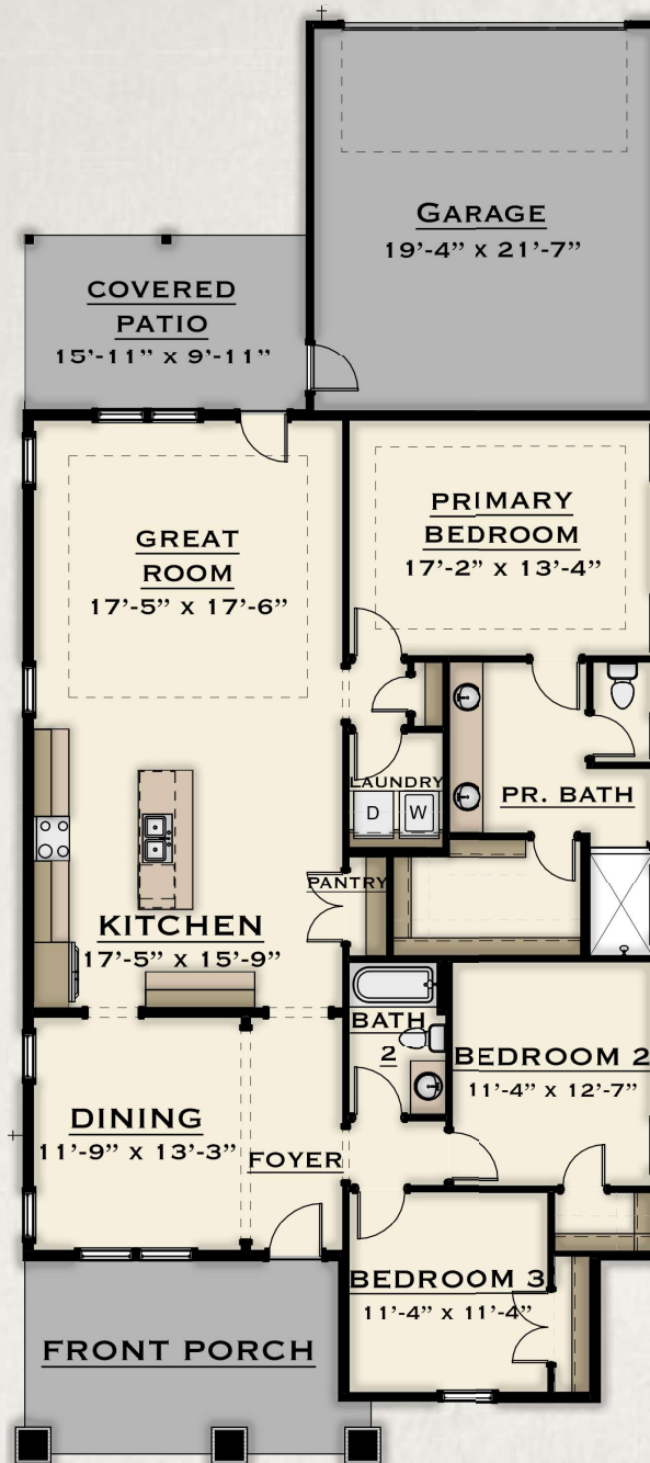
Main Level - Elevation C