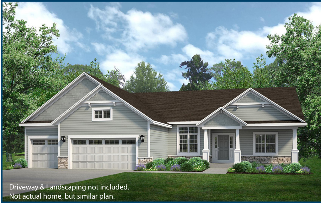
Driveway & Landscaping not included. Not actual home, but similar plan.