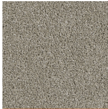
Carpet: Dwellings Groundworks - Vela

Home elevation renderings and color selection sample images are for illustration purpose only. Digital representation of colors may vary from the actual product. Price accurate as of 05/13/2026. Builder reserves the right to make changes without notice.