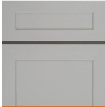
Cabinetry: Birch - Ashen