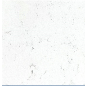
Kitchen Countertops: Quartz - Carrara Pisa