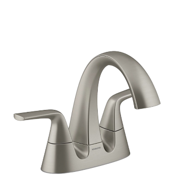
Bathroom Plumbing: Kohler Medley Brushed Nickel