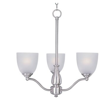
Lighting: Maxim Stefan Collection Brushed Nickel