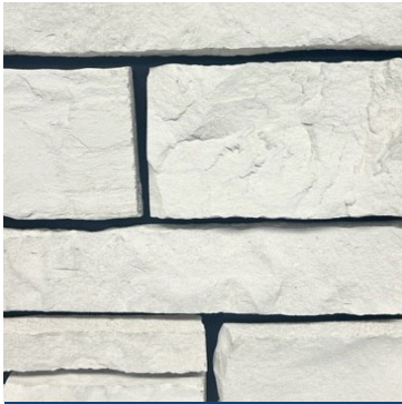
Fireplace Masonry: White Loon