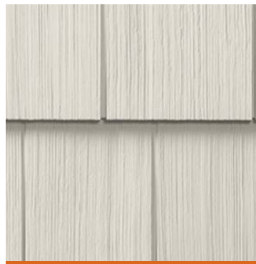
Shake Siding: Herringbone