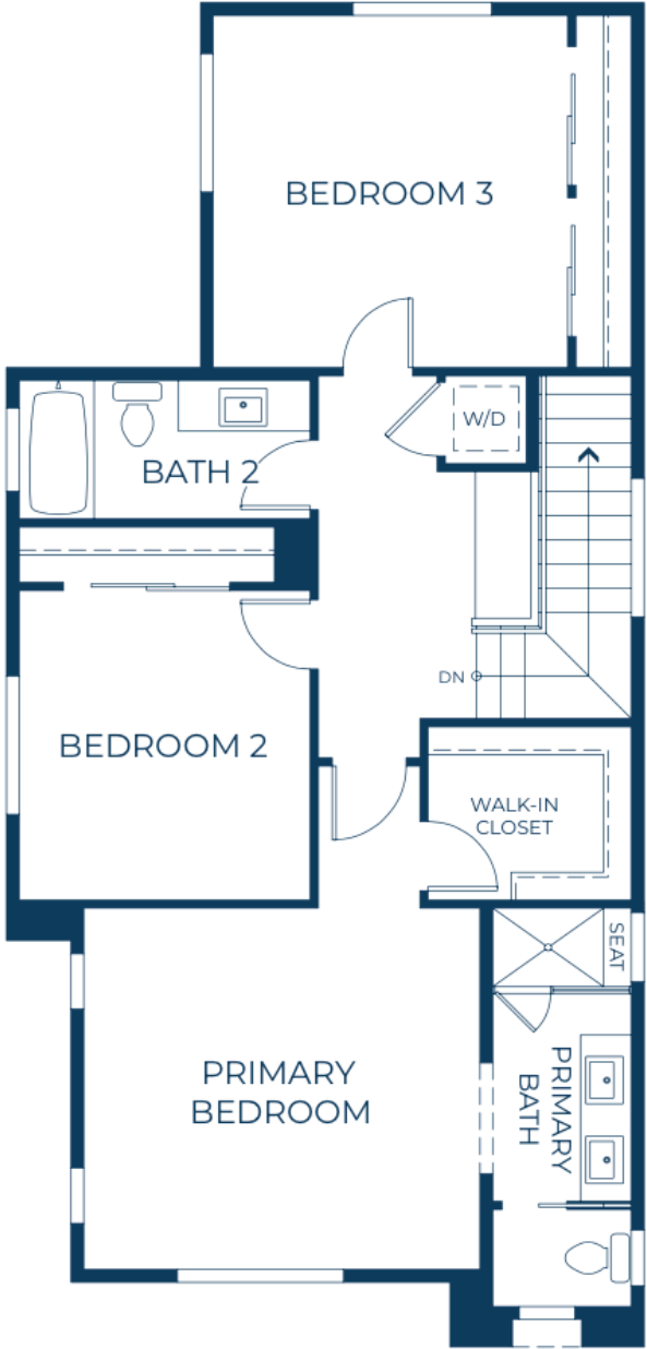
ELEVATION A SECOND FLOOR