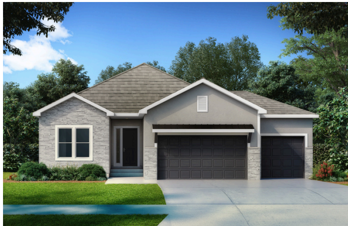
Heritage Stucco and stone with black metal eyebrow