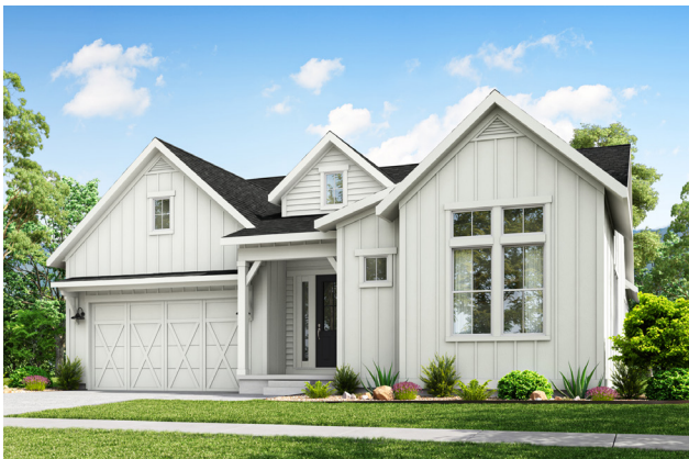
ELEVATION A (FARMHOUSE)

2,445 Sq. Ft. Finished Above Ground 1,494 Sq. Ft. Unfinished Basement 3-5 Bedrooms 2.5-4.5 Bathrooms 2-Car Garage