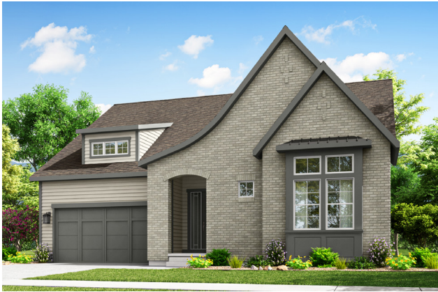
ELEVATION F (TUDOR)