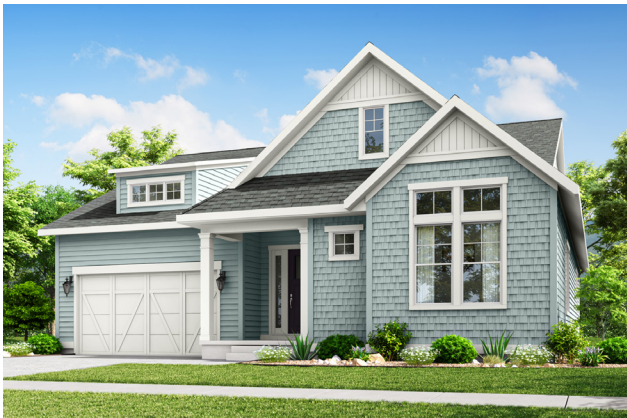
ELEVATION C (SHINGLE)