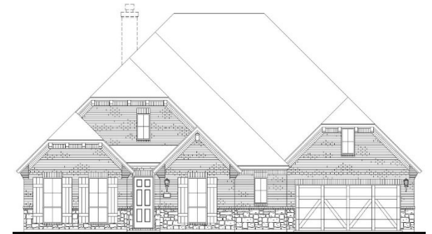
Elevation B with Stone