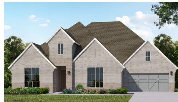
Elevation C with Stone

American Legend Homes reserves the right to change prices, plans, specifications, square footage and availability without prior notice or obligation. Square footages are approximate and may vary upon elevations and/or options selected. Elevations depicted are an artist's rendering and are subject to change or modification without notice. Not responsible for typographical errors. Please see a Sales Associate for more information. American Legend Homes and the ALH logo are registered trademarks of American Legend Homes, LLC. © 2020 American Legend Homes. All rights reserved. Plan 854_02/02/2026