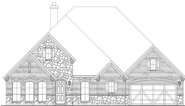
Elevation A with Stone