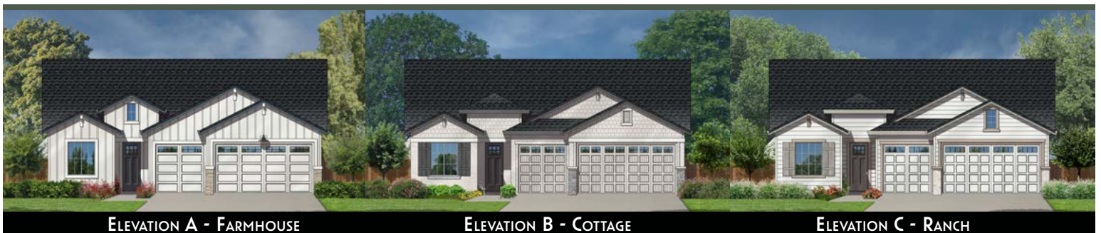
ELEVATION A - FARMHOUSE