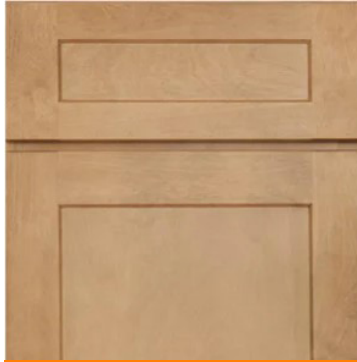
Cabinetry: Birch - Karamel