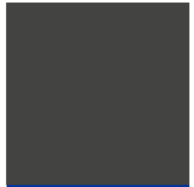
Front Door: SW7069 Iron Ore