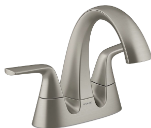
Bathroom Plumbing: Kohler Medley Brushed Nickel