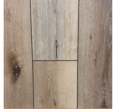
Flooring: Inspired LVP- Centennial