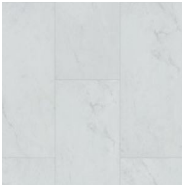
Bathroom Flooring: Bianco Marble