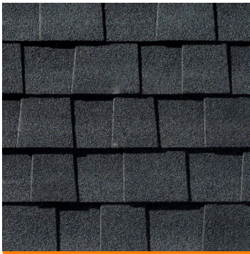
Roof Shingles: Charcoal