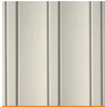
Vertical Siding: Herringbone