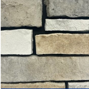
Fireplace Masonry: Heather Ridge Ledgerstone