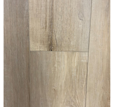
Flooring: Inspired LVP- Napa