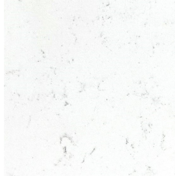
Kitchen Countertops: Quartz - Carrara Pisa