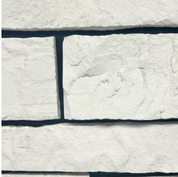
Fireplace Masonry: White Loon LedgeStone