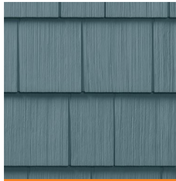
Shake Siding: Wedgewood Blue