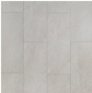
Bathroom Flooring: Serena Limestone