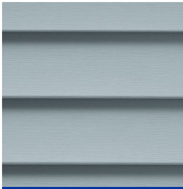
Siding: Oxford Blue