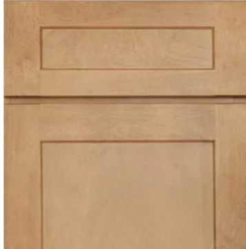
Cabinetry: Birch - Karamel