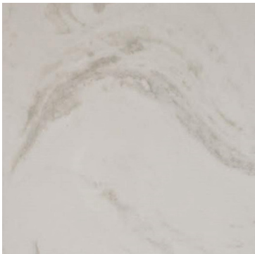
Bathroom Countertops: Molded Marble- Tender Gray on White