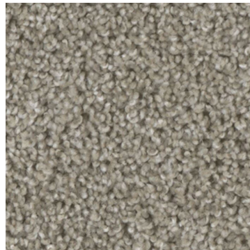
Carpet: Dwellings - Accolade - Vela

Home elevation renderings and color selection sample images are for illustration purpose only. Digital representation of colors may vary from the actual product. Price accurate as of 12/11/2025. Builder reserves the right to make changes without notice.