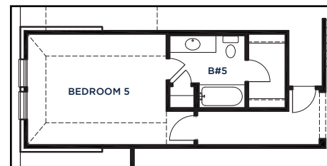
BEDROOM 5 AND BATH 5 OPTION