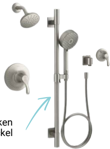
Kohler Awaken Brushed Nickel