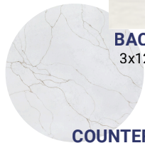
BACKSPLASH 3x12 Flow White