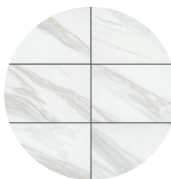
FLOOR TILE CS81 12x24 Timeless Marble