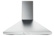
Dishwasher, Microwave, Built-In Gas Cooktop, Wall Oven