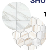
CS81 12x24 Timeless Marble