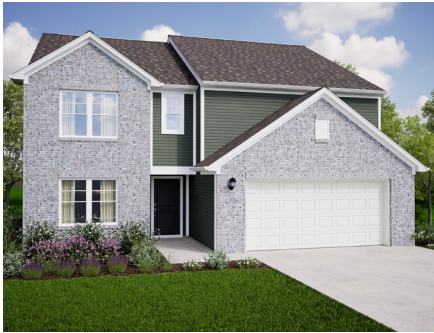
SHOWN WITH BRICK OPTION C