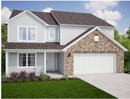
SHOWN WITH BRICK OPTION A