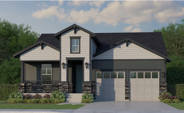
Elevation A with Stone