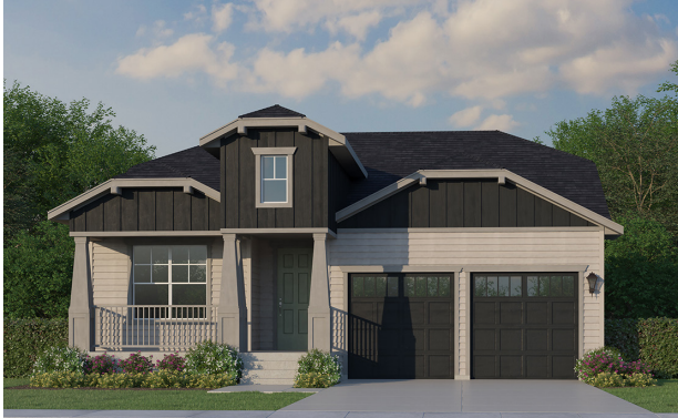
Elevation B with Stone