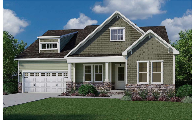
Optional Elevation B2