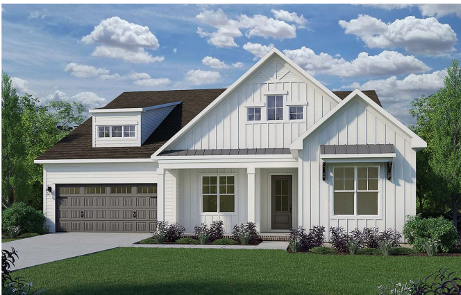
Optional Elevation C3