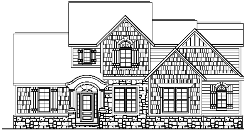
“The Eastern Seaboard”