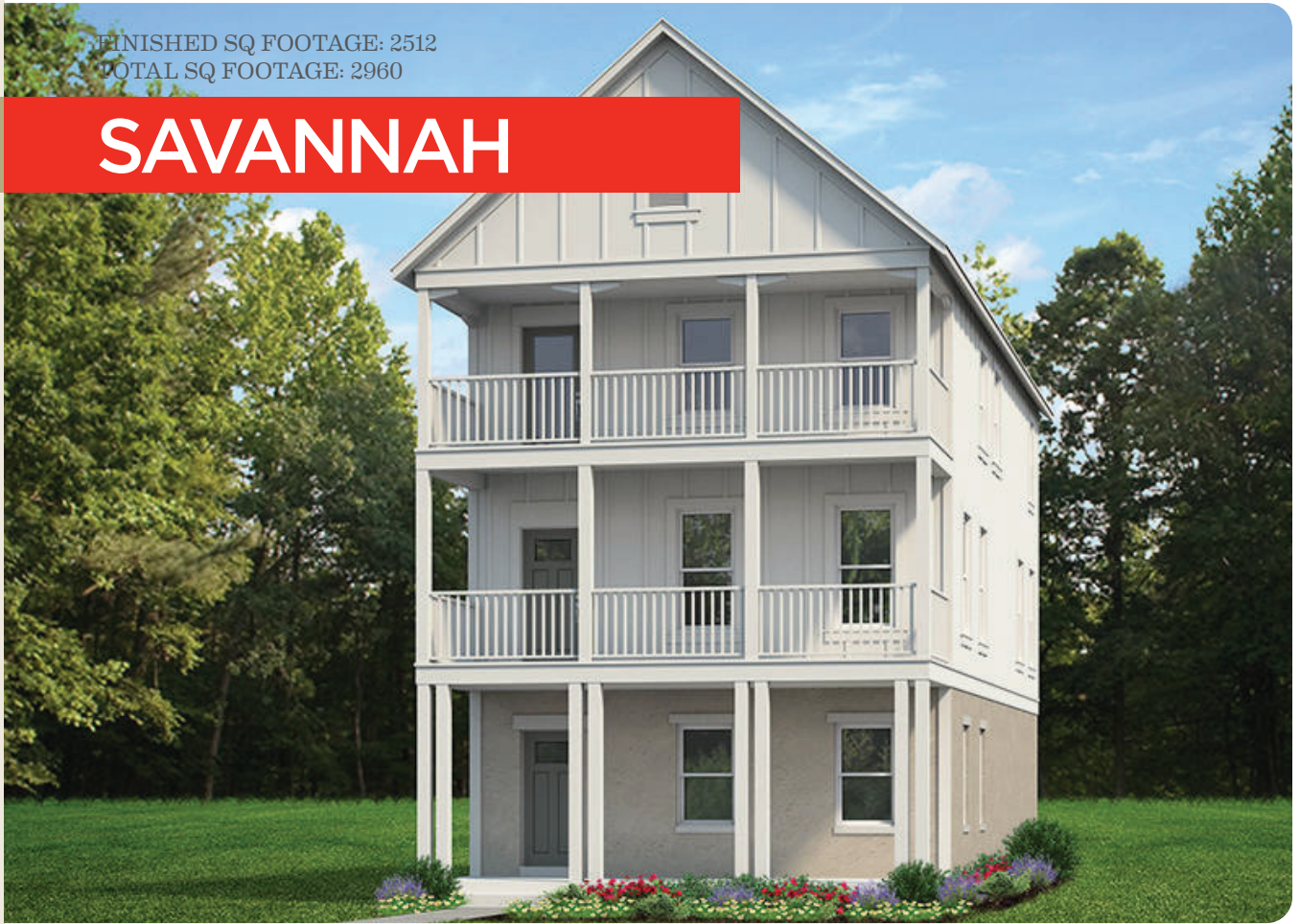
ARTS & CRAFTS II ELEVATION