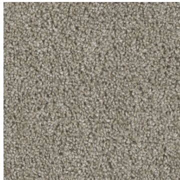
Carpet: Dwellings - Accolade - Vela

Home elevation renderings and color selection sample images are for illustration purpose only. Digital representation of colors may vary from the actual product. Price accurate as of 09/10/2025. Builder reserves the right to make changes without notice.