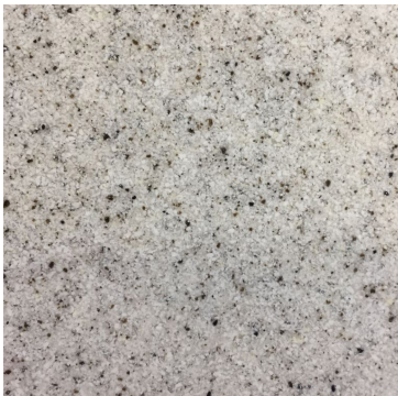
Bathroom Countertops: Molded Marble- Ecru Granite