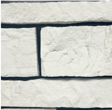
Fireplace Masonry: White Loon