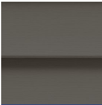
Siding: Smoky Gray