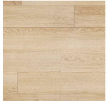
Flooring: InHouse Laminate - Solido Visions - Hobart