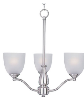
Lighting: Maxim Stefan Collection Brushed Nickel