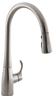
Kitchen Plumbing: Kohler Simplice Vibrant Stainless

Home elevation renderings and color selection sample images are for illustration purpose only. Digital representation of colors may vary from the actual product. Price accurate as of 09/10/2025. Builder reserves the right to make changes without notice.