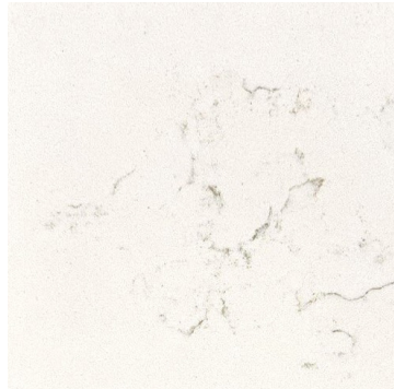
Kitchen Countertops: Quartz - Carrara Roma