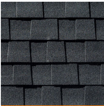
Roof Shingles: Charcoal