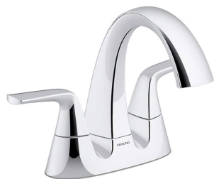
Bathroom Plumbing: Kohler Medley Chrome