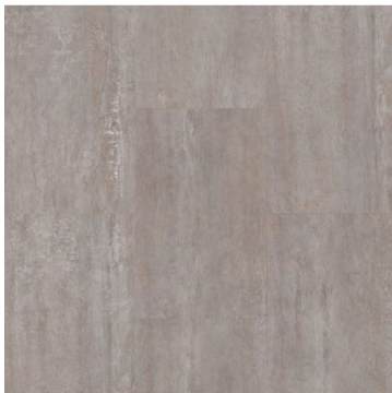
Bathroom Flooring: LW Mountain - Quarry - Capri