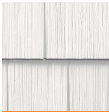
Vertical Siding: Colonial White