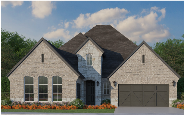
Elevation A with Stone