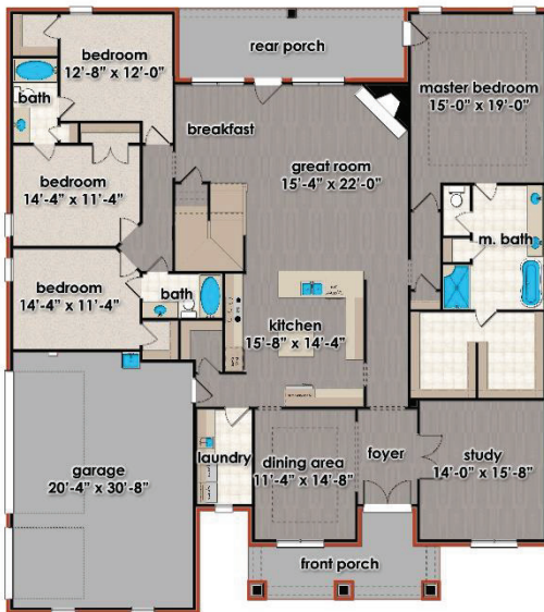
Main Level Floor 3,034 sf