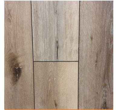
Flooring: Inspired LVP- Centennial