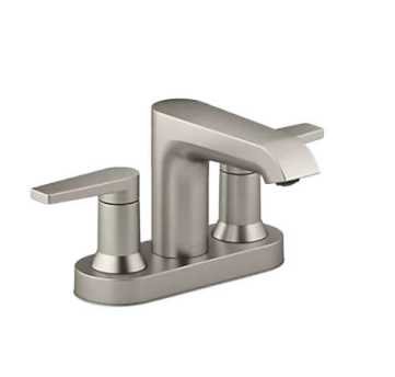
Bathroom Plumbing: Kohler Hint Brushed Nickel