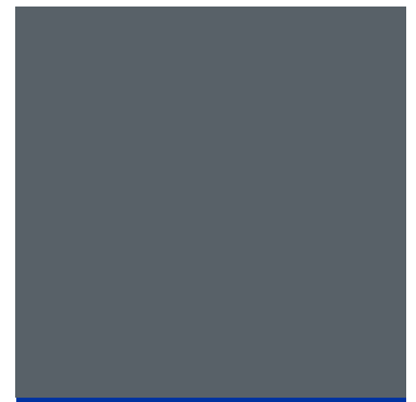
Front Door: SW6251 Outerspace