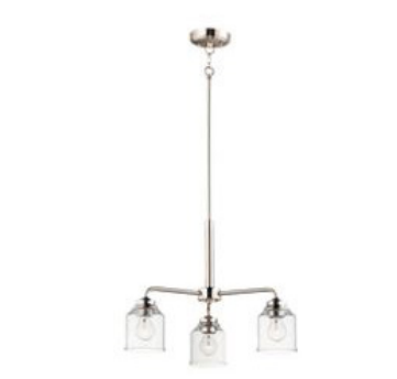
Lighting: Maxim Acadia Collection Brushed Nickel