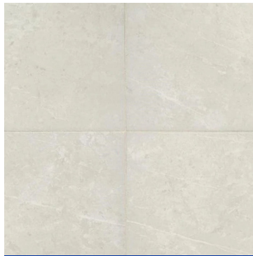
Bathroom Flooring: 12"x12" Vitality White