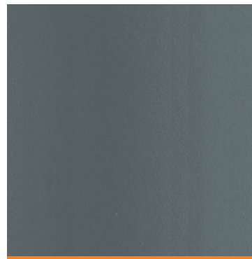
Shake Siding: Boothbay Blue