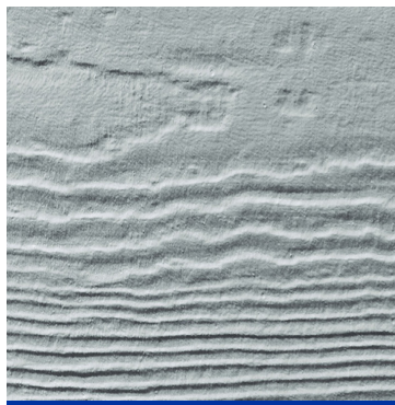
Siding: Light Mist