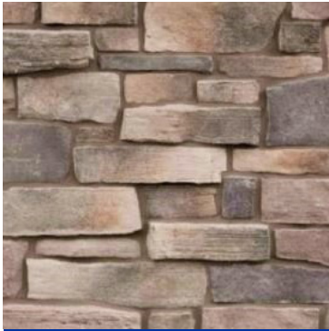
Fireplace Masonry: Winona Weatheredge