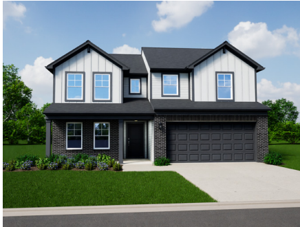
SHOWN WITH BRICK OPTION C