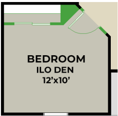
OPTIONAL BEDROOM I/O DEN