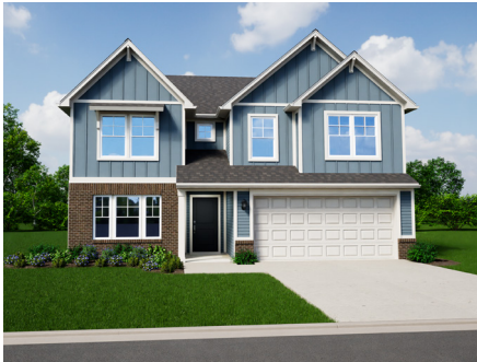
SHOWN WITH BRICK OPTION B