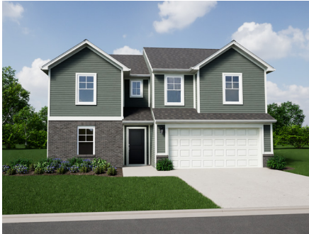
SHOWN WITH BRICK OPTION B