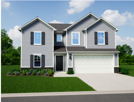
SHOWN WITH BRICK OPTION A