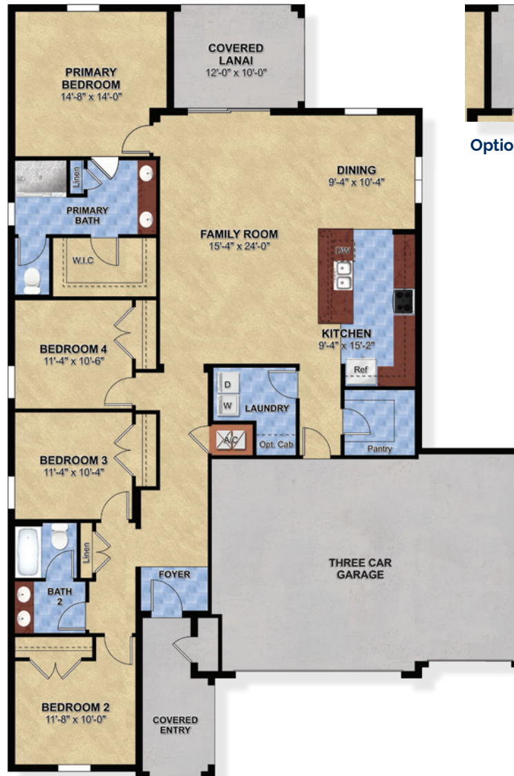
BASE FLOOR PLAN