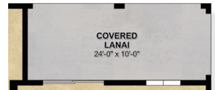
Optional Extended Covered Lanai (#00076)