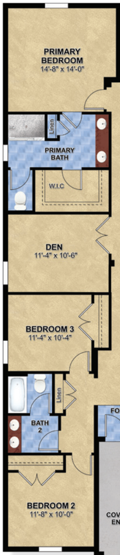
Optional 3 Bedroom with Den (Includes Extended Lanai) (#00077)